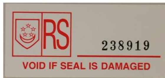
Tamper-evident paper adhesive seal