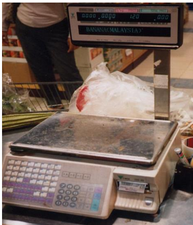
Non-automatic weighing instruments

Below are some examples of weighing and measuring instruments that are used for trade purposes that will be verified and stamped by AVs.